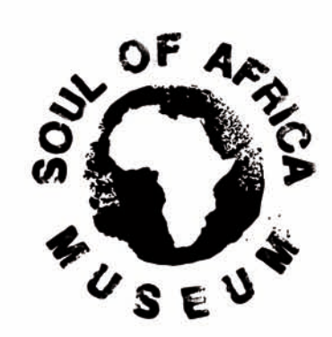
SOUL OF AFRICA MUSEUM Rüttenscheider Strasse 36 D-45128 Essen